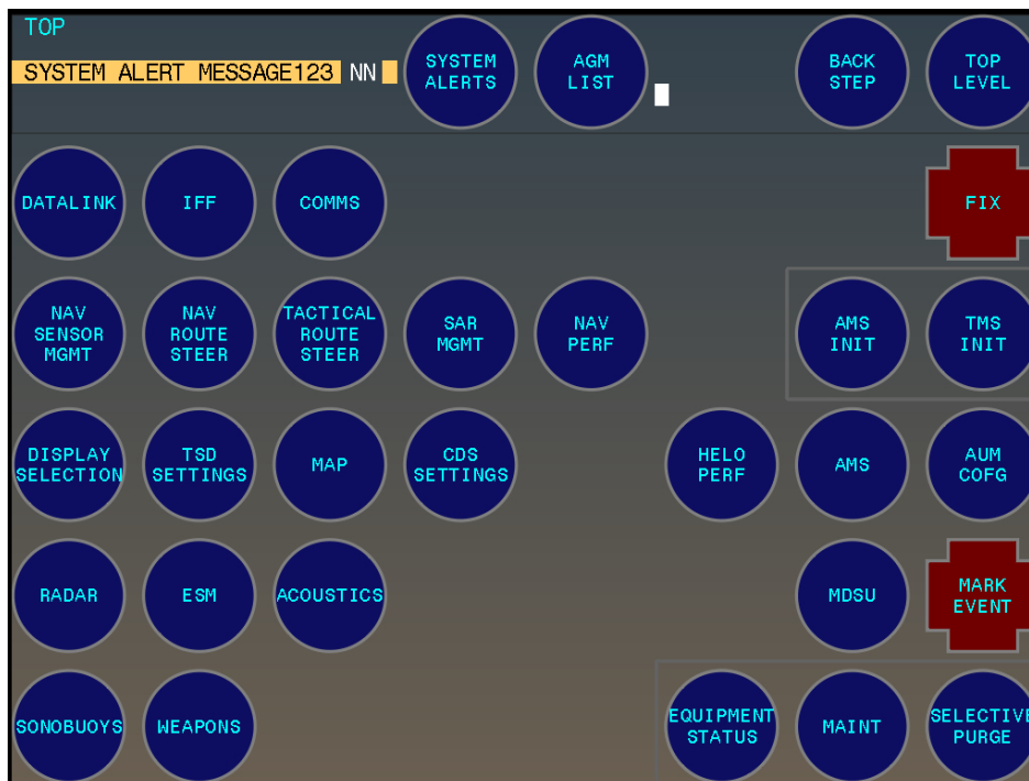
Figure 3: TSU top-level display

The TSU top-level display is shown in Figure 3. The top row of the display contains a persistent layer containing critical system messages and widgets for buttons to return to the top-level display and to enable the aircrew to step backward from the most recent selection. The blue circle widgets enable the aircrew to select the menus for the corresponding helicopter subsystems, and the red cross widgets allow the aircrew to enter input selections and parameters.